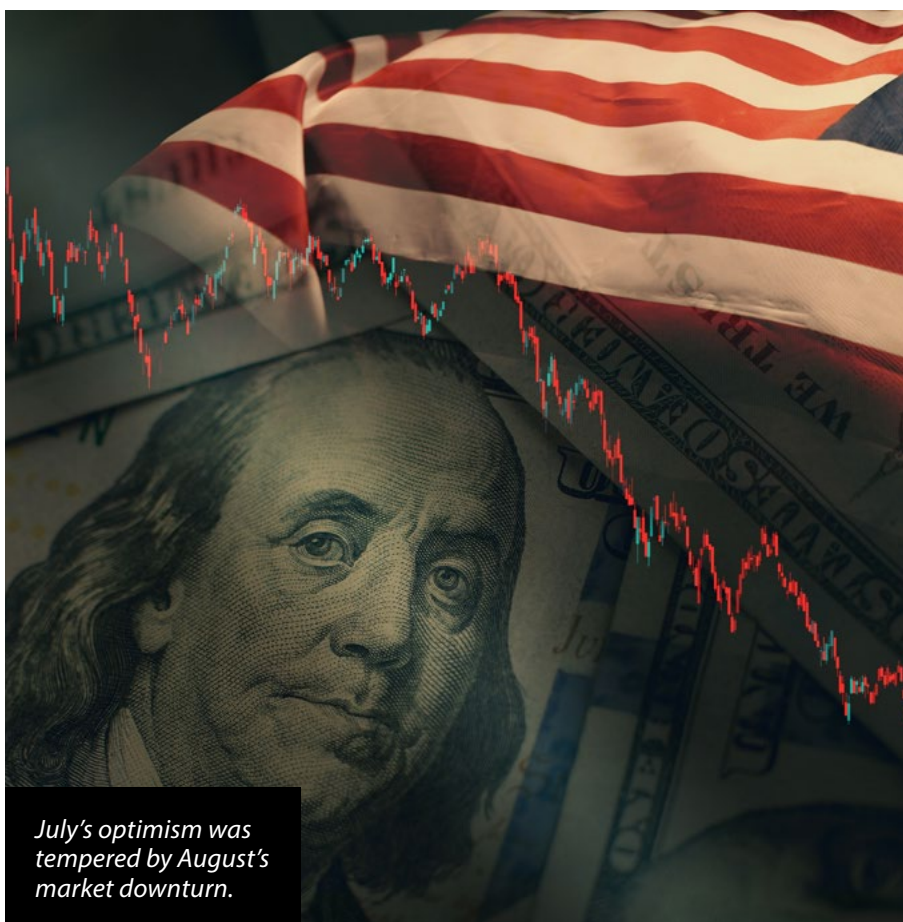
July's optimism was tempered by August's market downturn.